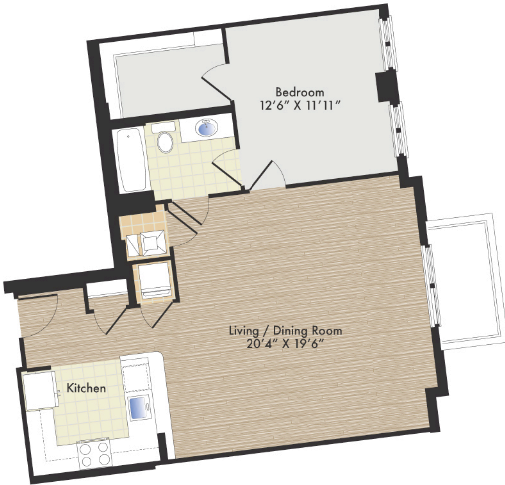
Typical 3rd and 4th levels