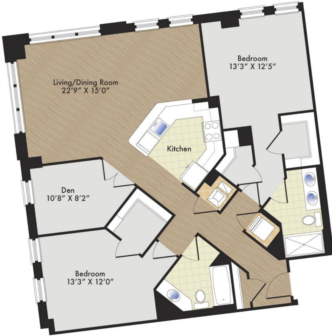
Typical 3rd and 4th levels