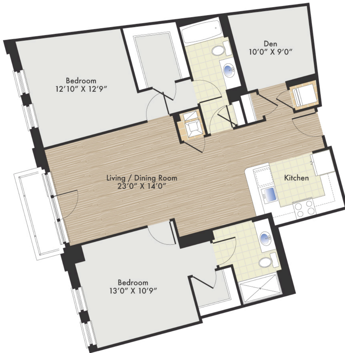
Typical 3rd and 4th levels