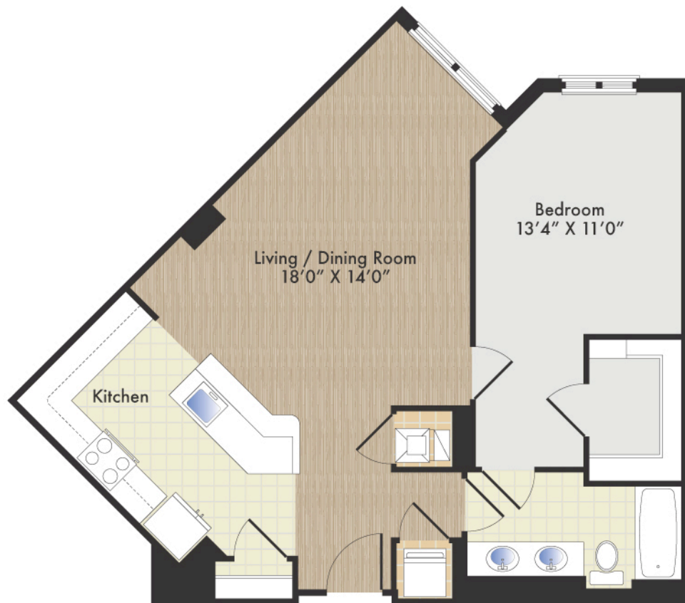
Typical 3rd and 4th levels