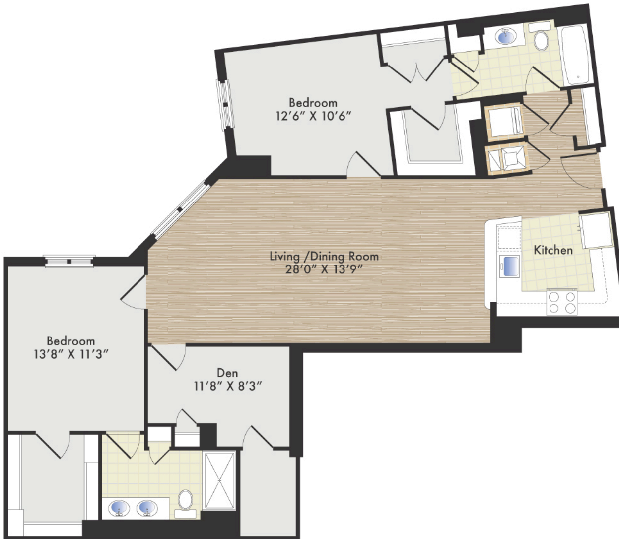
Typical 3rd and 4th levels