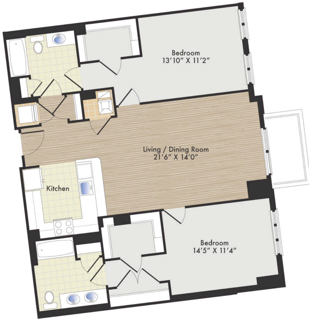
Typical 3rd and 4th levels